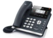
Yealink T4 series